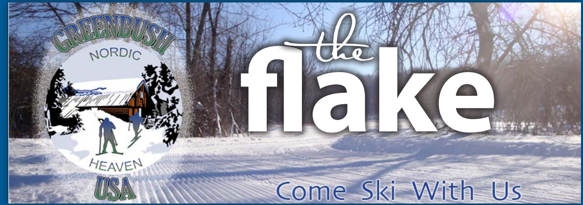
A Newsletter of the Northern Kettle Moraine Nordic Ski Club FALL 2016

Northern Kettle Moraine Nordic Ski Club W6681 Esker Ridge Elkhart Lake, WI 53020